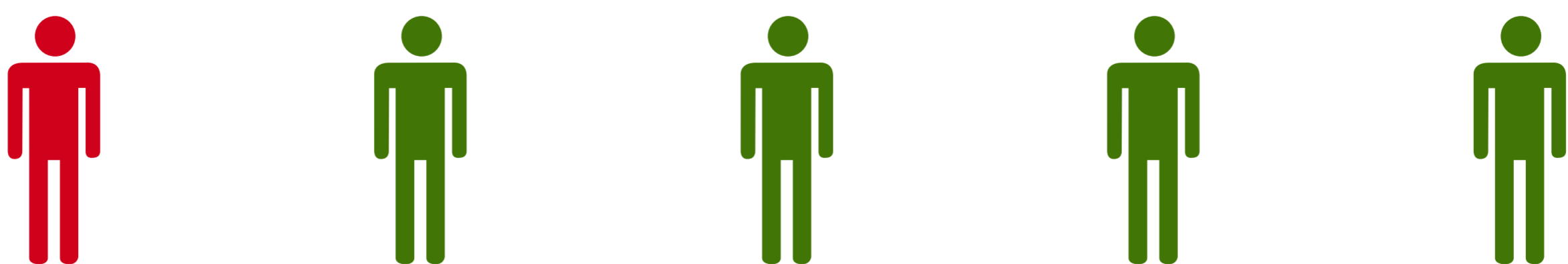
Success Rate in Appealing a Denied Insurance Claim

■ Appeal NOT Successful (20%) ■ Appeal Successful (80%)